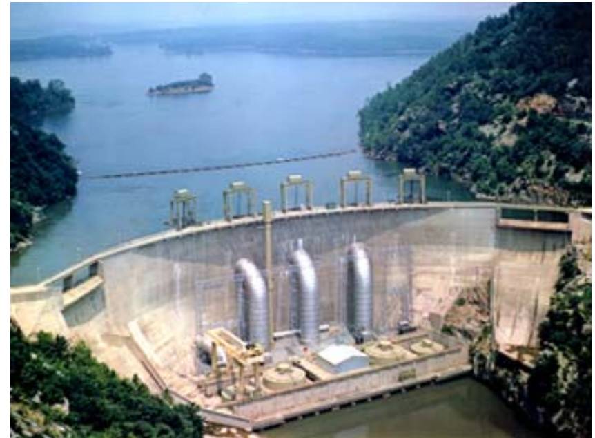
636 MW Smith Mountain Lake Pumped Storage Hydro Facility